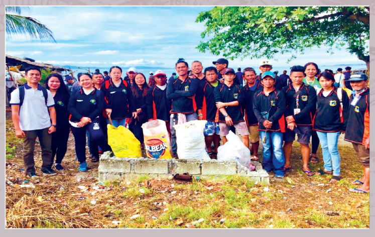
Coastal Clean-up Drive during Earth Day on April 22, 2019.

The steps he incorporates with his work to attain gender mainstreaming in fisheries include steadfast community organizing, conducting GAD orientations and trainings, and creating provisions on gender sensitive livelihood projects.